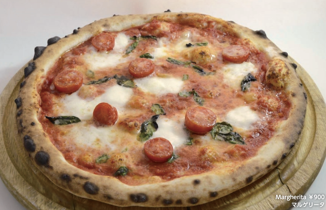
Margherita ¥900 マルゲリータ