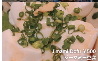
Jimami Dofu ¥500 ジーマー豆腐

ADDRESS 3-2-13, Koenji-kita, Suginami-ku, Tokyo TEL 03-3337-1352 CLOSE Open every day HOURS 5 p.m. - 5 a.m. URL http://www.dachibin.com/dachibin/