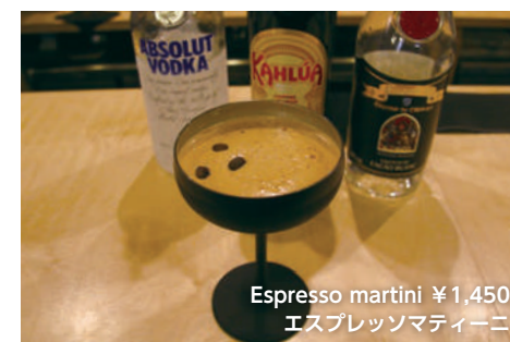
Espresso martini ¥1,450 エスプレッソマティーニ

朝のコーヒータイムから夜のリラックスタイムまで利用できるカフェ。コーヒーにこだわり、日本ではまだ知る人が少ないコーヒーカクテルが飲めるのも特徴。料理もビザトースト（¥450）やカレーライス（¥880）など、コーヒーに合うものが多い。2Fは座敷席になっており、そこで仕事をする人も。思い思いのスタイルでくつろげる店。