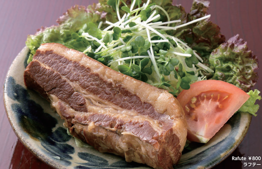
Rafute ¥800 ラフテー