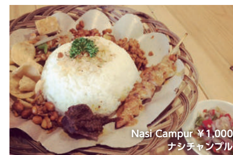
Nasi Campur ¥1,000 ナシチャンプル